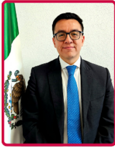
Miguel Reyes Moncayo Mexican Foreign Ministry